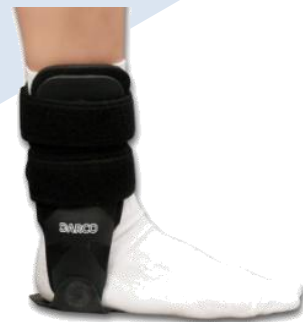
Body Armor® Stirrup Ankle Brace

DARCO offers a comprehensive line of ankle products